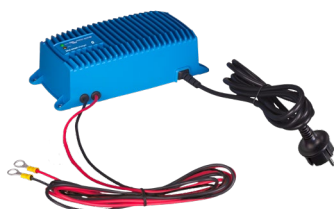
Blue Smart IP67 Charger 12/25