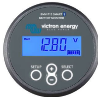
BMV-712 Smart Battery Monitor or SmartShunt enables temperature and voltage compensated charging. The battery charge current information can for example be used to switch from absorption charging to float charging at a set battery tail current.