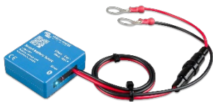
Smart Battery Sense Enables temperature and voltage compensated charging.