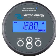
BMV-712 Smart Battery Monitor