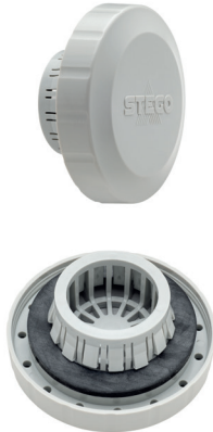
Photo: Inside view